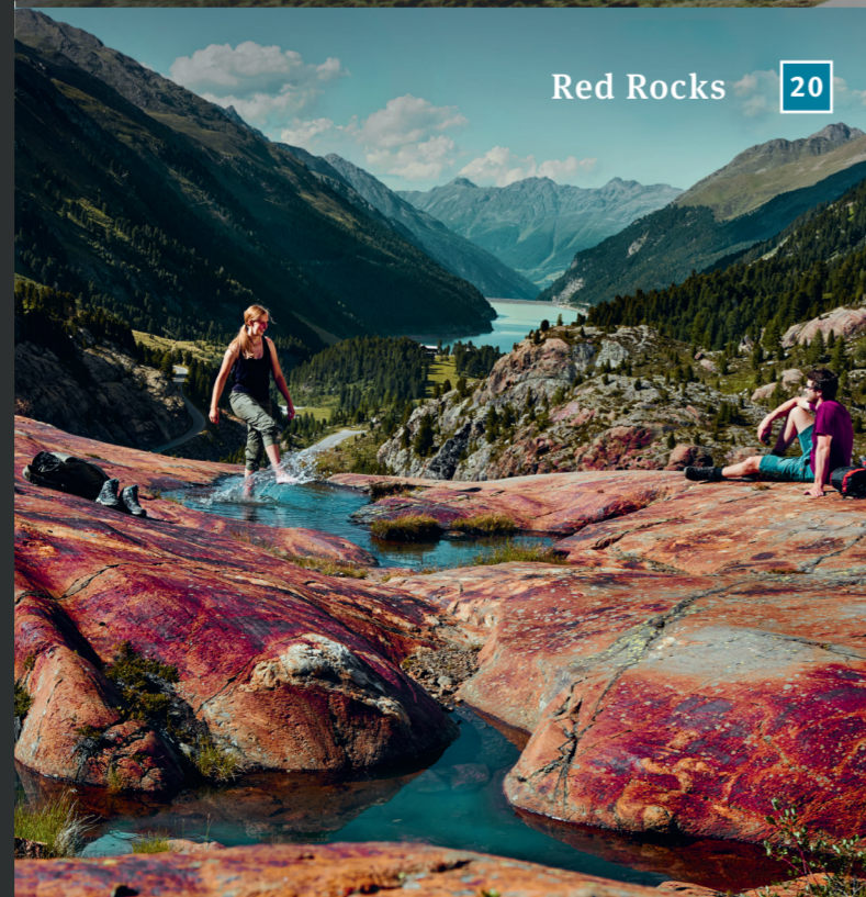
Red Rocks 20