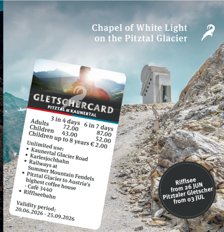
Chapel of White Light on the Pitztal Glacier