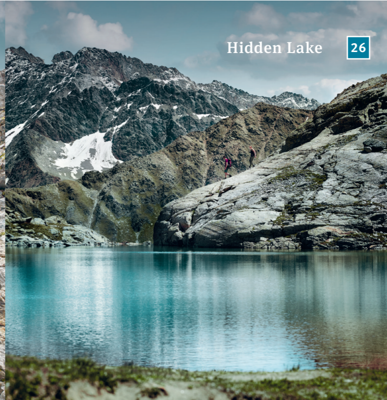
Hidden Lake 26

Riffelsee from 26 JUN Pitztaler Gletscher from 03 JUL