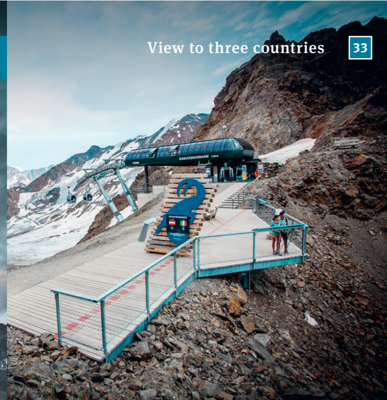
View to three countries 33